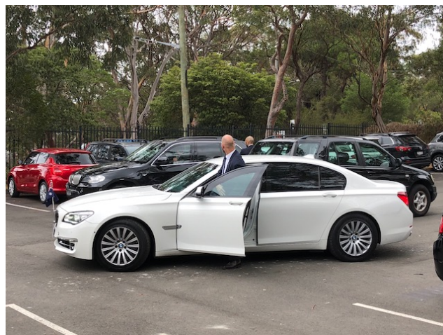
Farewell Prime Minister Turnbull