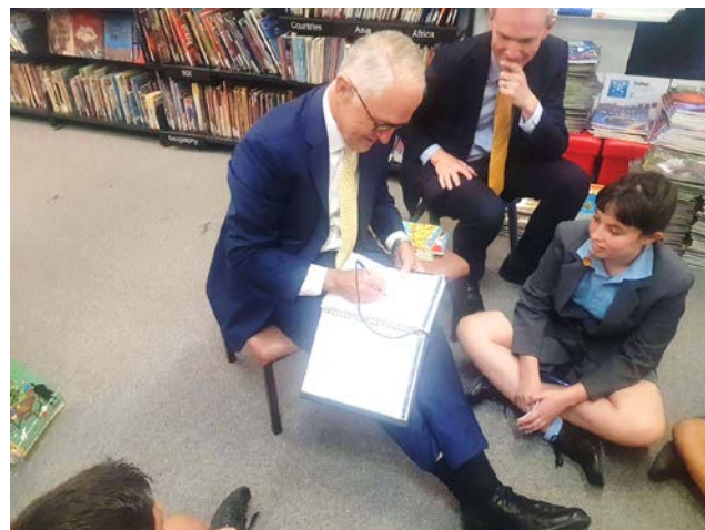
Signing the school Visitor's Book