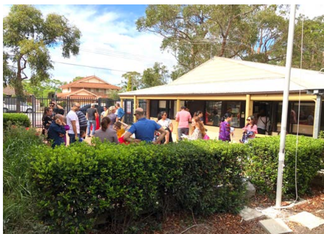
Parents saying goodbye as Kinders leave with their teacher