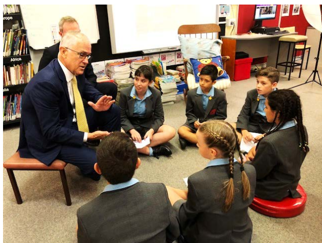
Deep discussion about the problems and cures for The Great Barrier Reef