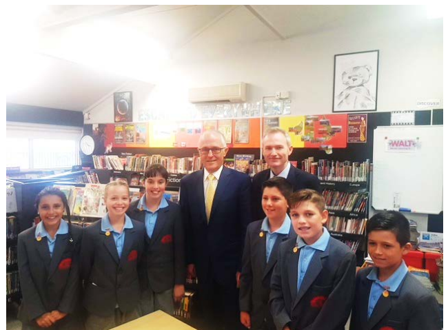
The PM also took the time to discuss how important reading is especially to primary age children.