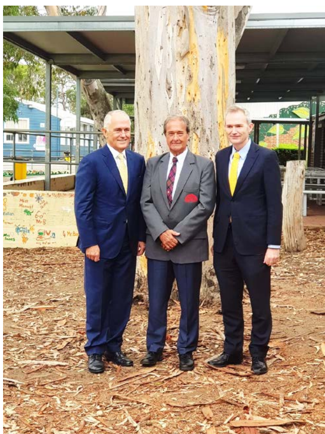
I just couldn't leave this one out !!!!