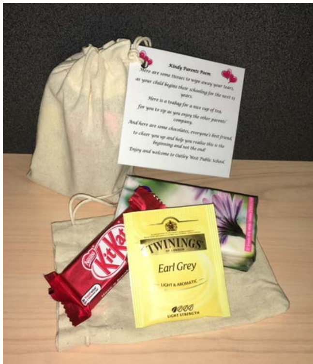
A thoughtful little package for parents on behalf of the Kindergarten teachers.