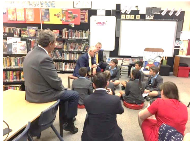
Question time with the SRC Seniors