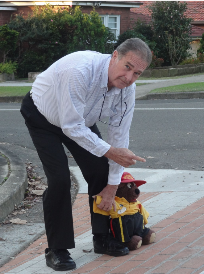
Discussing how to use the pedestrian crossing with Oatley Bear this morning.

Please be careful when you are using any pedestrian crossing. Never cross while using headphones or mobile phones. Never assume a driver has seen you. You must look to the right look to the left and look to the right again before crossing the road, making sure there are no cars or that all cars have stopped.