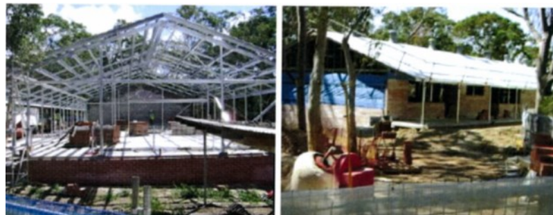
Building of M Block — 2011