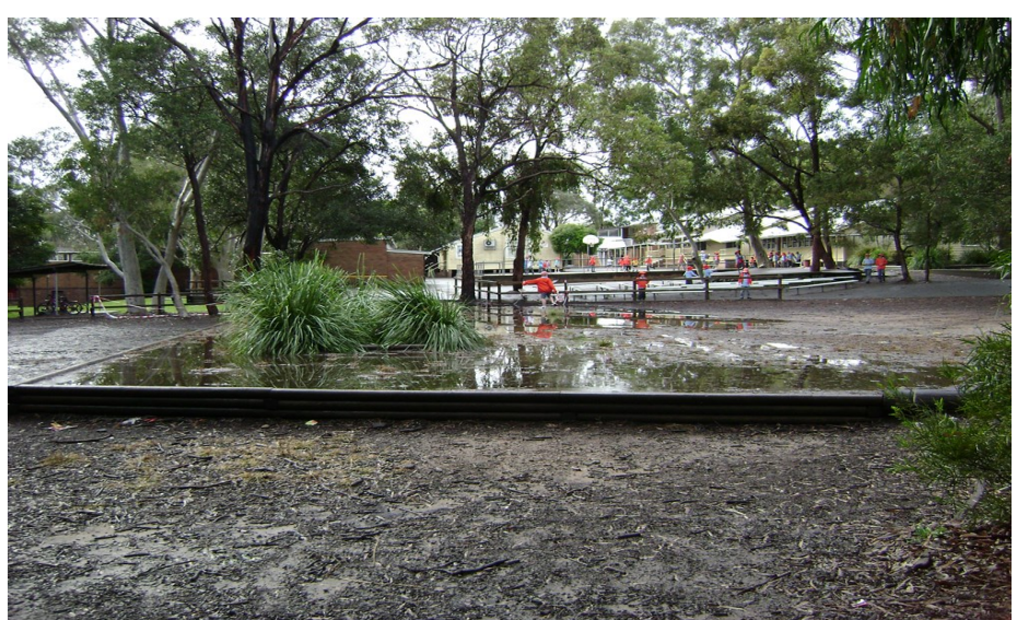
The 'Dirt Playground' before the Astro Turf was installed in 2009.

Wishing everyone a happy vacation. Term 4 resumes on Monday 14th October 2019.